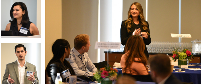
Participants at Jones Day’s 1L Diversity Conference, April 22, 2022, Dallas, Texas.

Jones Day will accept applications for the 2023 “Perspectives and Pathways” Conference starting December 1, 2022. Please visit www.jonesdaydiversity.com for more information and an application.